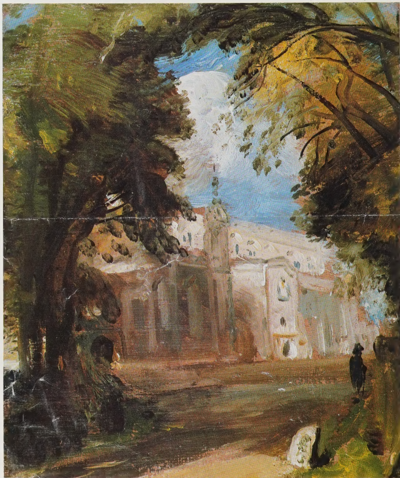
John Constable, R.A.: The Church at East Bergholt, oil on canvas, 7¼ by 6¼ in. (18.8 by 16 cm.)