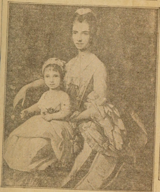
"Mother and Child," by Ralph Earl, purchased from the Goodman fund for the Friends of American Art collection, is one of the latest, if not the latest, acquisition of the Art institute. It is a striking portrait and a canvas in which the charm of dress lessens the tense pose suggested in the rather drawn lines of the faces of both the sitters.

I ag stab rop ce all L ever anti nebu and air b cron Th rain The voice open Th a my expla was stre