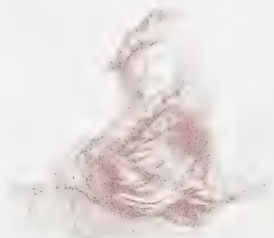
Rembrandt Leaning on a Stone Sill 1639 Etching National Gallery of Victoria