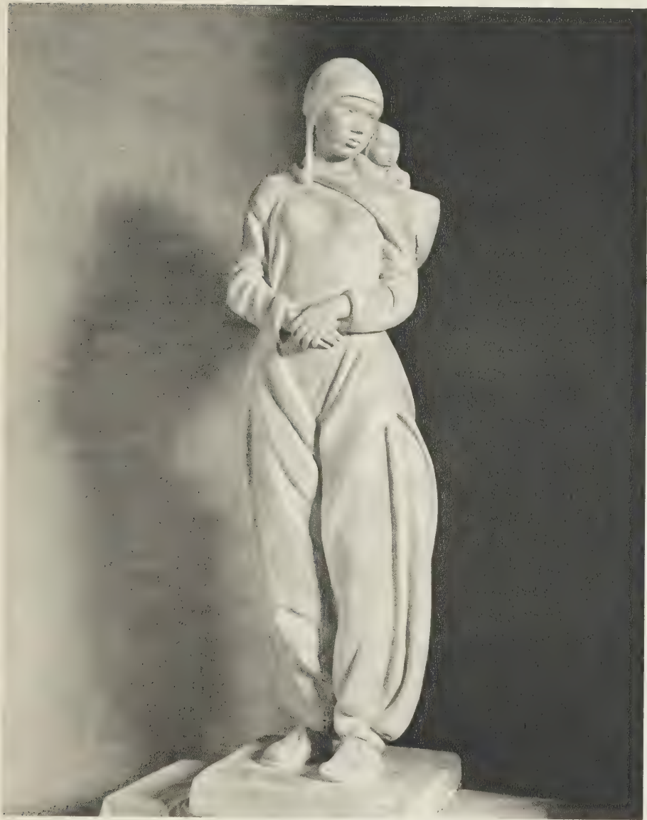
Frances Loring, A.R.C.A.