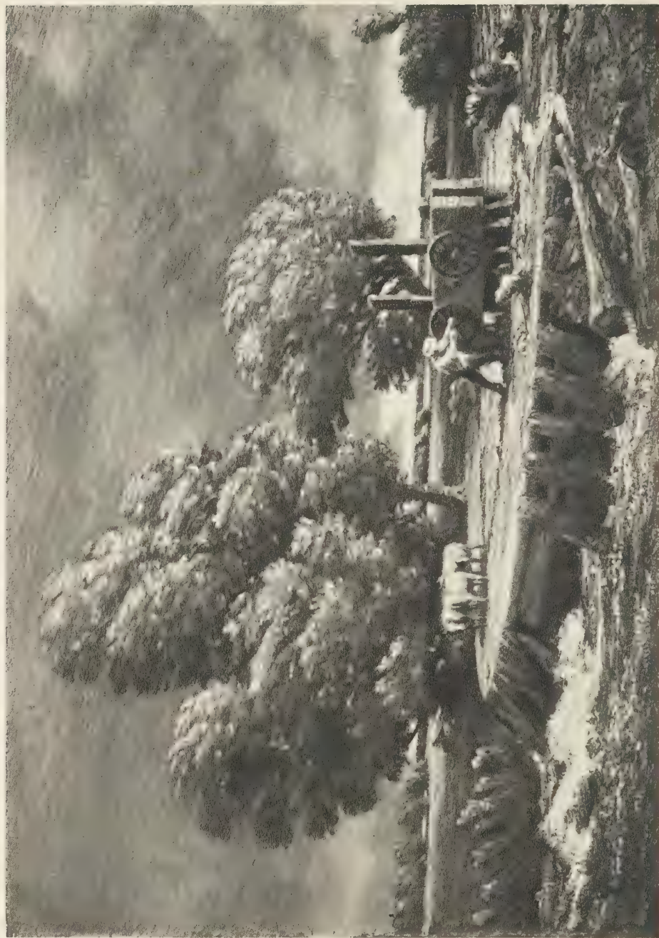
Homer Ransford Watson, R. C. A., 1855-1936