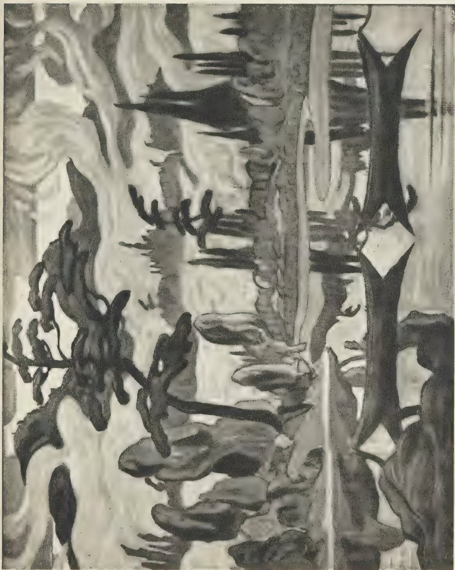
James E. H. Macdonald, R.C.A., 1873