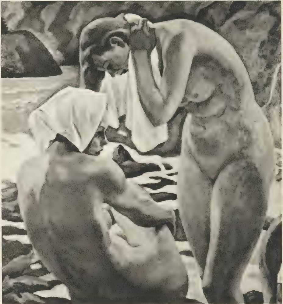
Edwin H. Holgate, R.C.A.