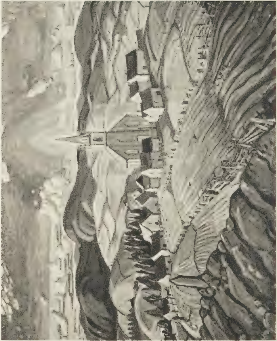
Arthur Lismer, A.R.C.A.