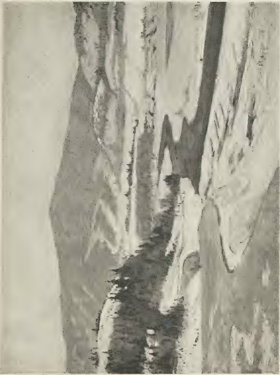
Maurice G. Cullen, R.C.A., 1866-1934