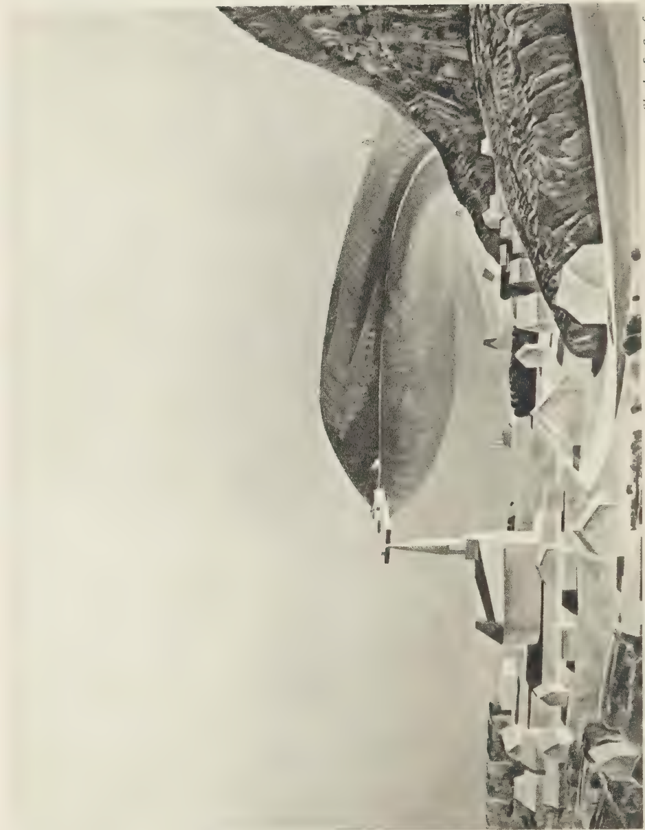
Charles F. Comfort