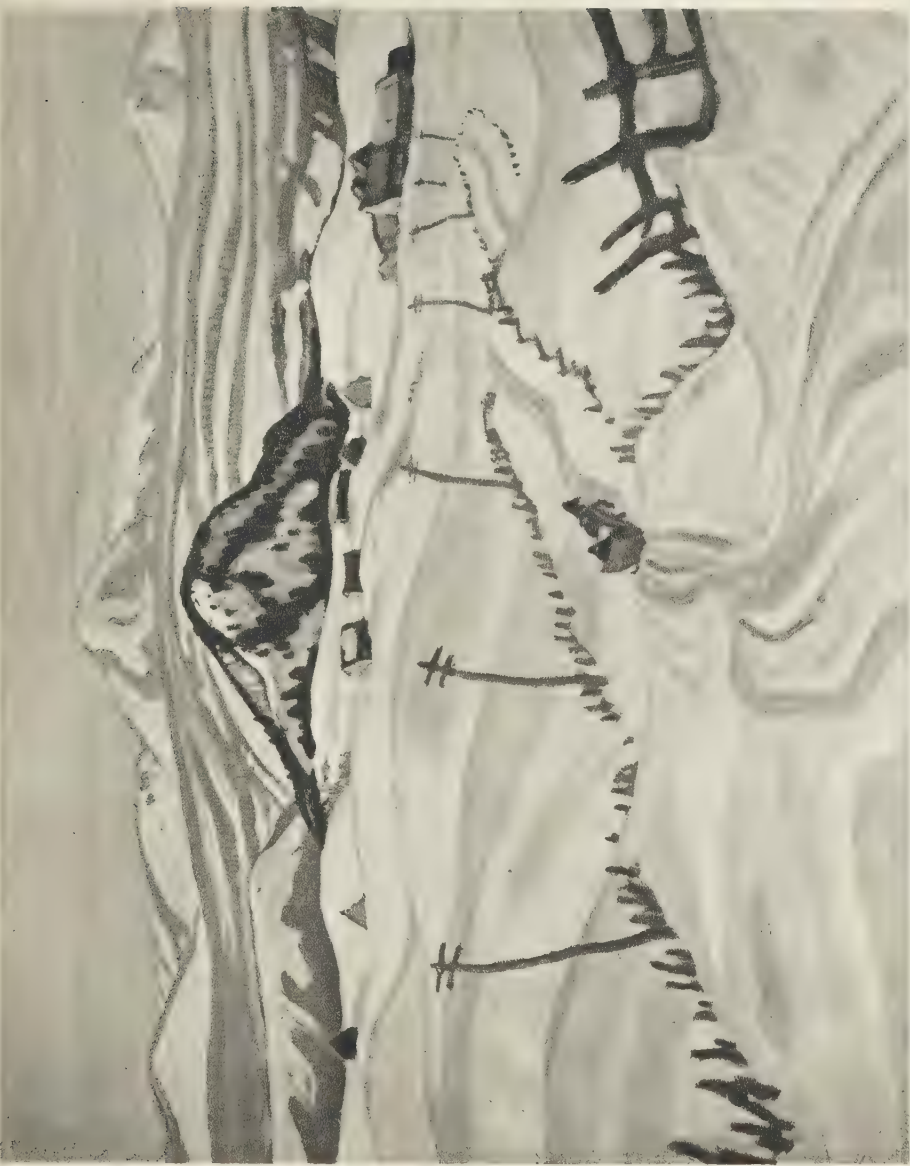
Alexander Y. Jackson