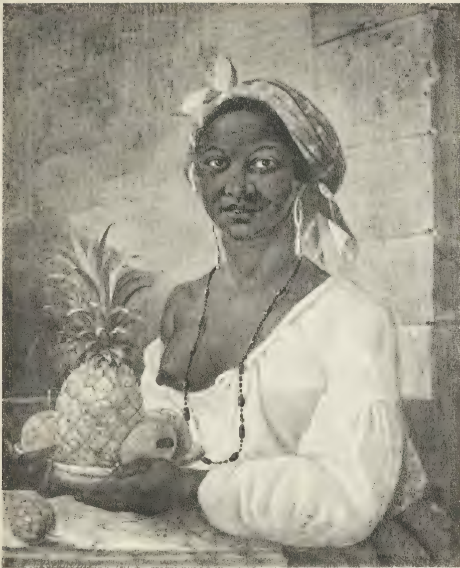
Francois Malepart de Beaucourt, 1740