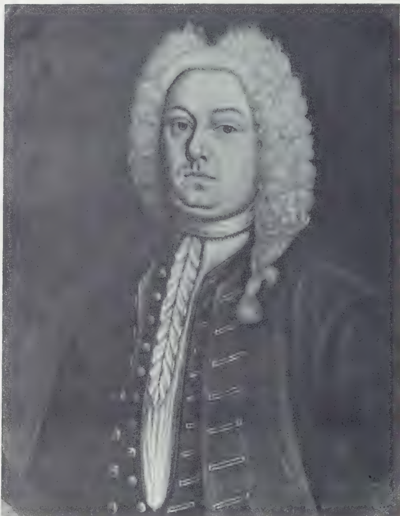
NATHANIEL EMMONS (1704-1740)