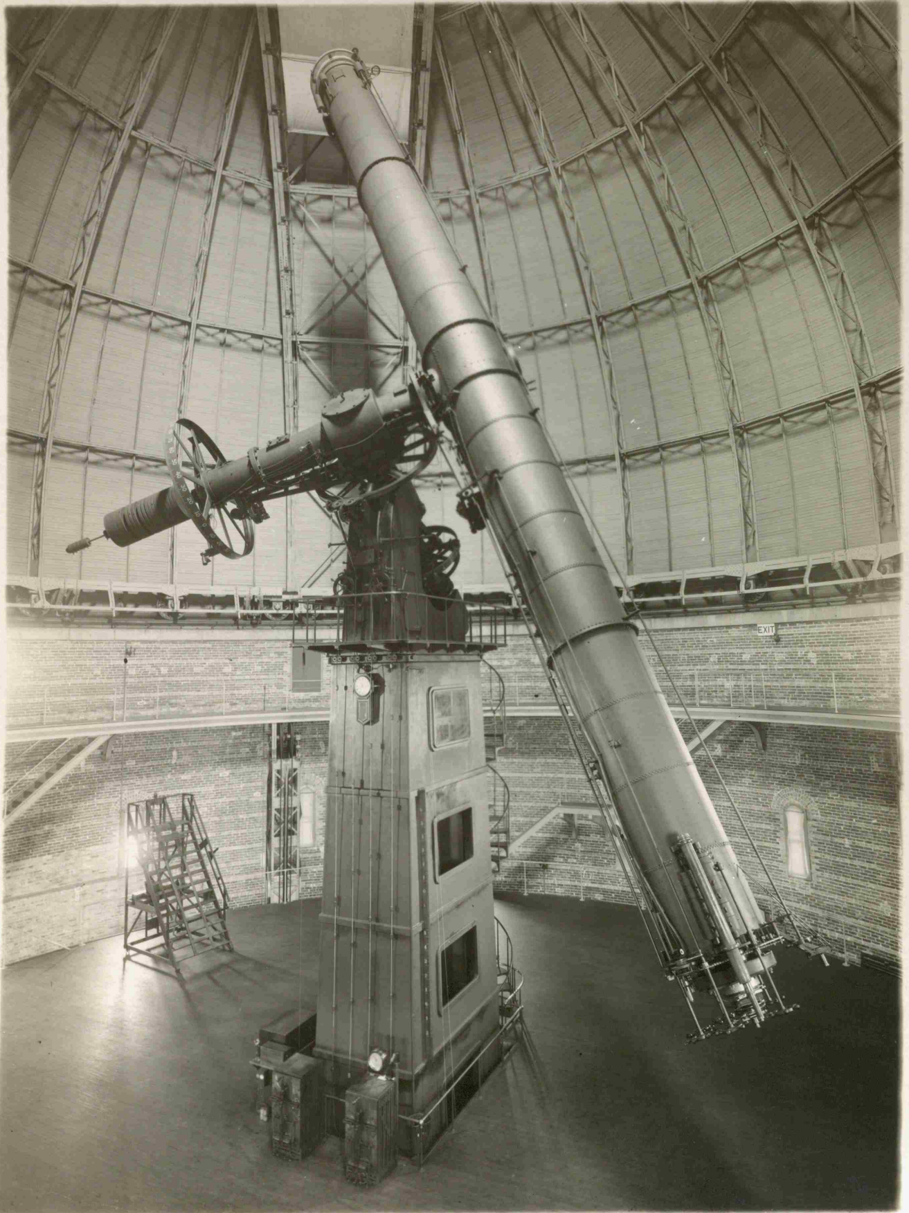
The telescope is at the base of the dome.