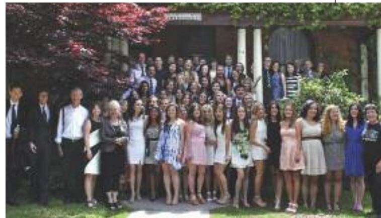
The last graduating class to get their picture on the steps of Film House Spring 2014.

To keep in touch with the History Department visit queensu.ca/history