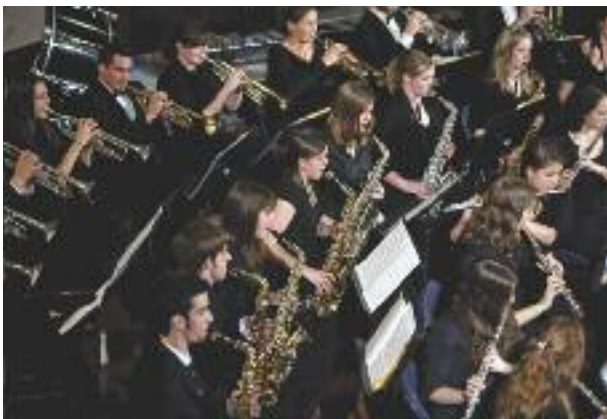
Students combine academic excellence and musical performance.

To keep in touch with the School of Music visit queensu.ca/music