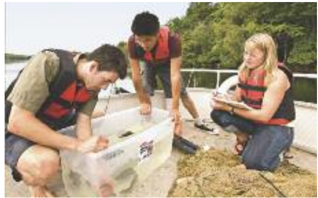
Field Research at QUBS, Lake Opinicon

To keep in touch with the School of Computing and see photos from the 45th reunion visit cs.queensu.ca