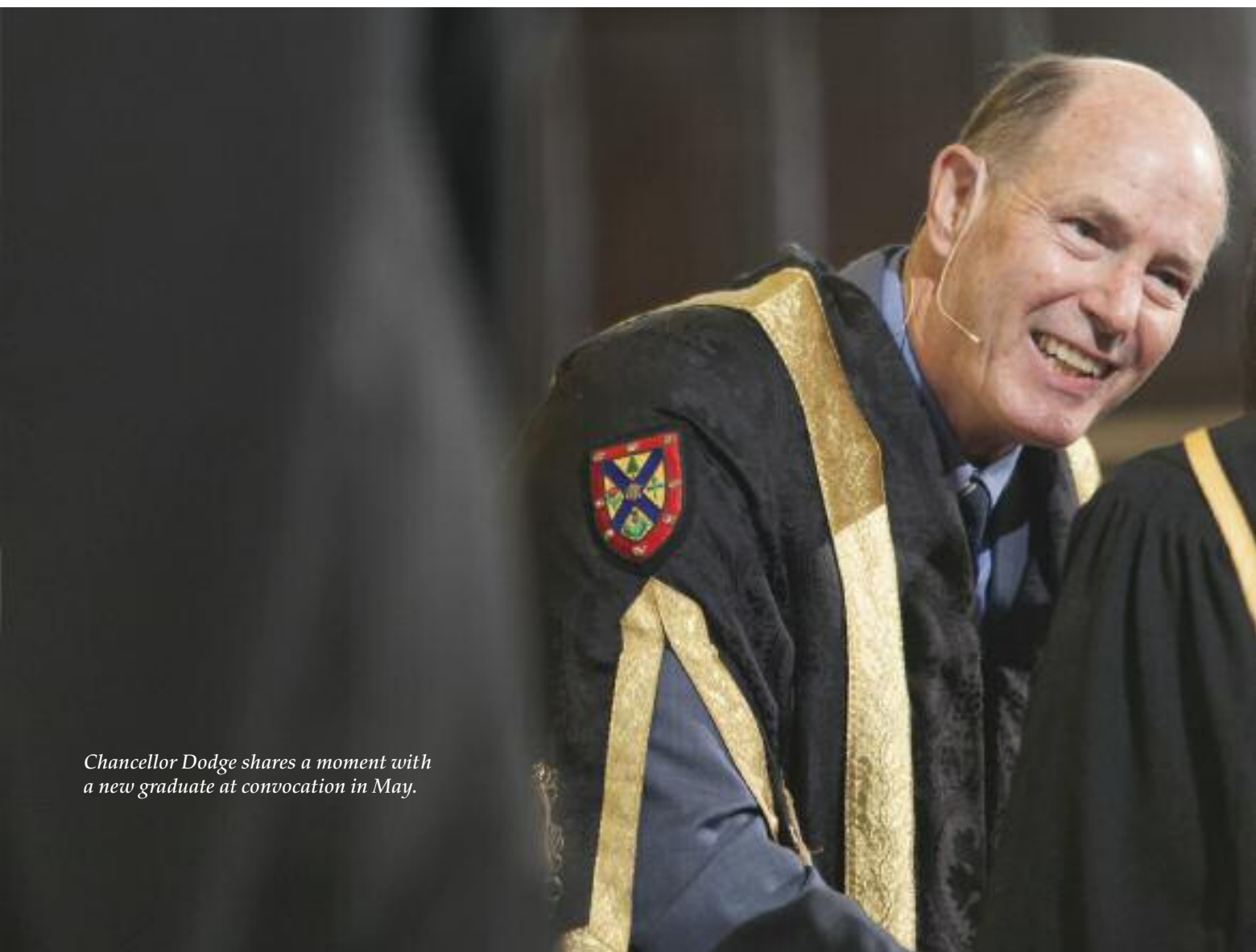
Chancellor Dodge shares a moment with a new graduate at convocation in May.

After two terms as the university's chancellor, David Dodge, Arts'65, LLD'02, hangs up his ceremonial garb. The Review caught up with him as he prepared to preside over his final convocation ceremonies.