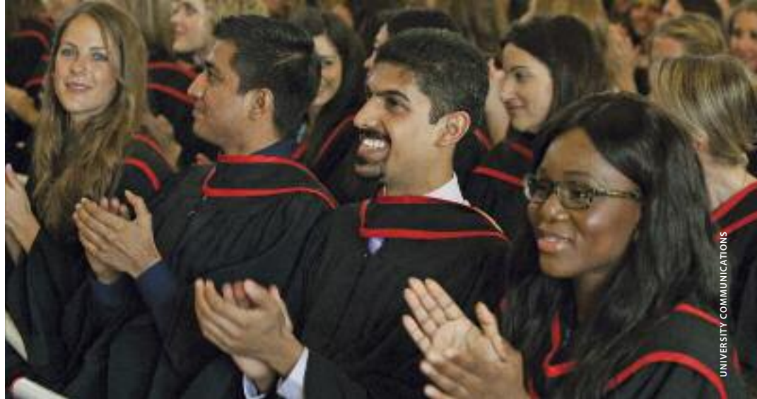
Spring convocation ceremonies welcomed new graduates into the Queen's University Alumni Association.

On behalf of the Queen's University Alumni Association (QUAA) and the entire Queen's alumni family, I want to extend my congratulations to the new graduates of the class of 2014! You are now a part of one of the most active alumni associations in the world. From a Queen's connection to help you land your first job to opening other doors for the future, remember that the Queen's alumni network is always at your disposal. Also, don't forget that your Queen's email address will continue to be active. We would love to hear about what you've been up to since graduation! Email me at quaa.president@queensu.ca .