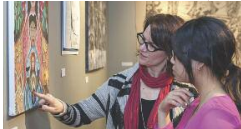
Students work closely with professors and mentors in Art History leading to many successes.

To keep in touch with the School of Urban and Regional Planning visit queensu.ca/surp