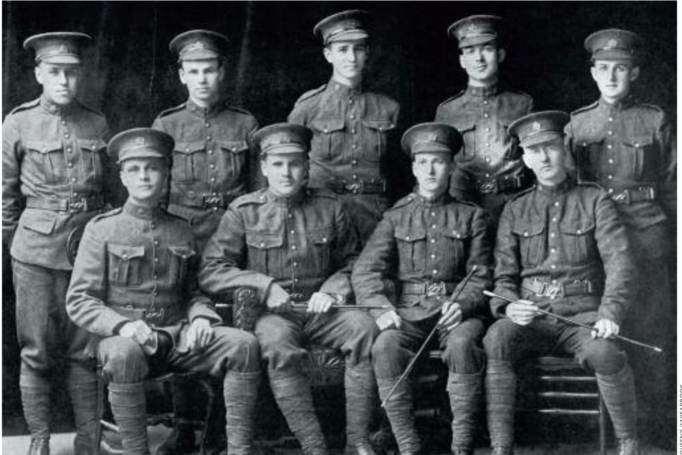
QUEEN'S 17 YEARBOOK

Queen's Alumni Review, Queen's University 99 University Avenue, Kingston, ON K7L 3N6