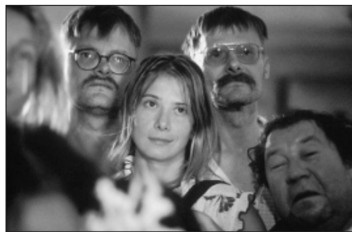
A scene from the House of Fools .

Run by the Department of Film Studies and a community advisory board, Cinema Kingston endeavors to bring the best and most challenging of Canadian and world cinema to Kingston. Films are booked through the Ontario Film Circuit, a subsidiary of the Toronto