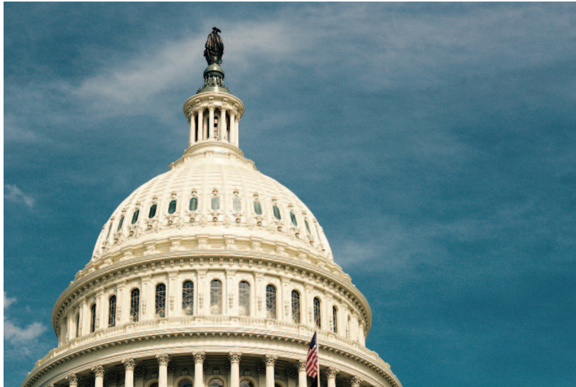
The Democratic Party gained a majority in the House of Representatives. The time has come for Democrats to start vigorously pushing the urgent priorities of inequality, access and fairness.

"The Democratic Party needs a revised image grounded in a new reality that will address basic issues of inequality, access and fairness. The central focus of a progressive program of reform must be to improve the lives of ordinary Americans, regardless of their race, gender or sexuality, and expand opportunities for personal and social mobility."