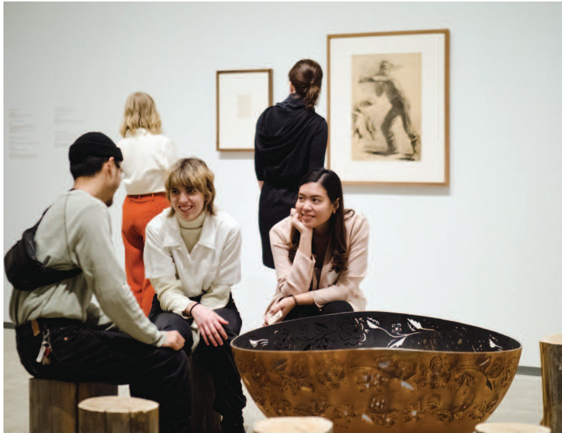
Attendees of the Agnes Etherington Art Centre winter season launch enjoy one of the installations for the new exhibit Soundings: An Exhibition in Five Parts .

How can a score be a call and tool for decolonization? Curated by Candice Hopkins (Tlingit) and Dylan Robinson (Stó:lō), Soundings: An Exhibition in Five Parts features newly-commissioned scores and sounds for decolonization by Indigenous artists who attempt to answer this question. The scores take the form of video, objects, graphic notation, museological ob-