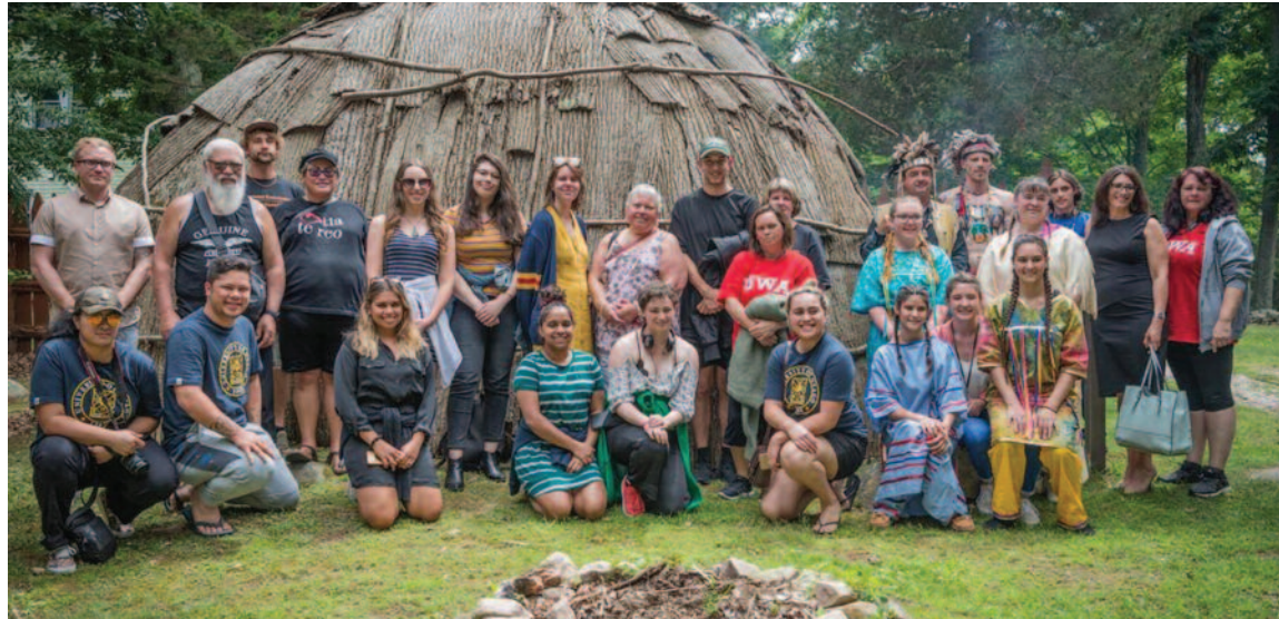
The 2018 Matariki Indigenous Student Mobility Program (MISMP) group visits Tantaquidgeon Museum at Mohegan Nation.