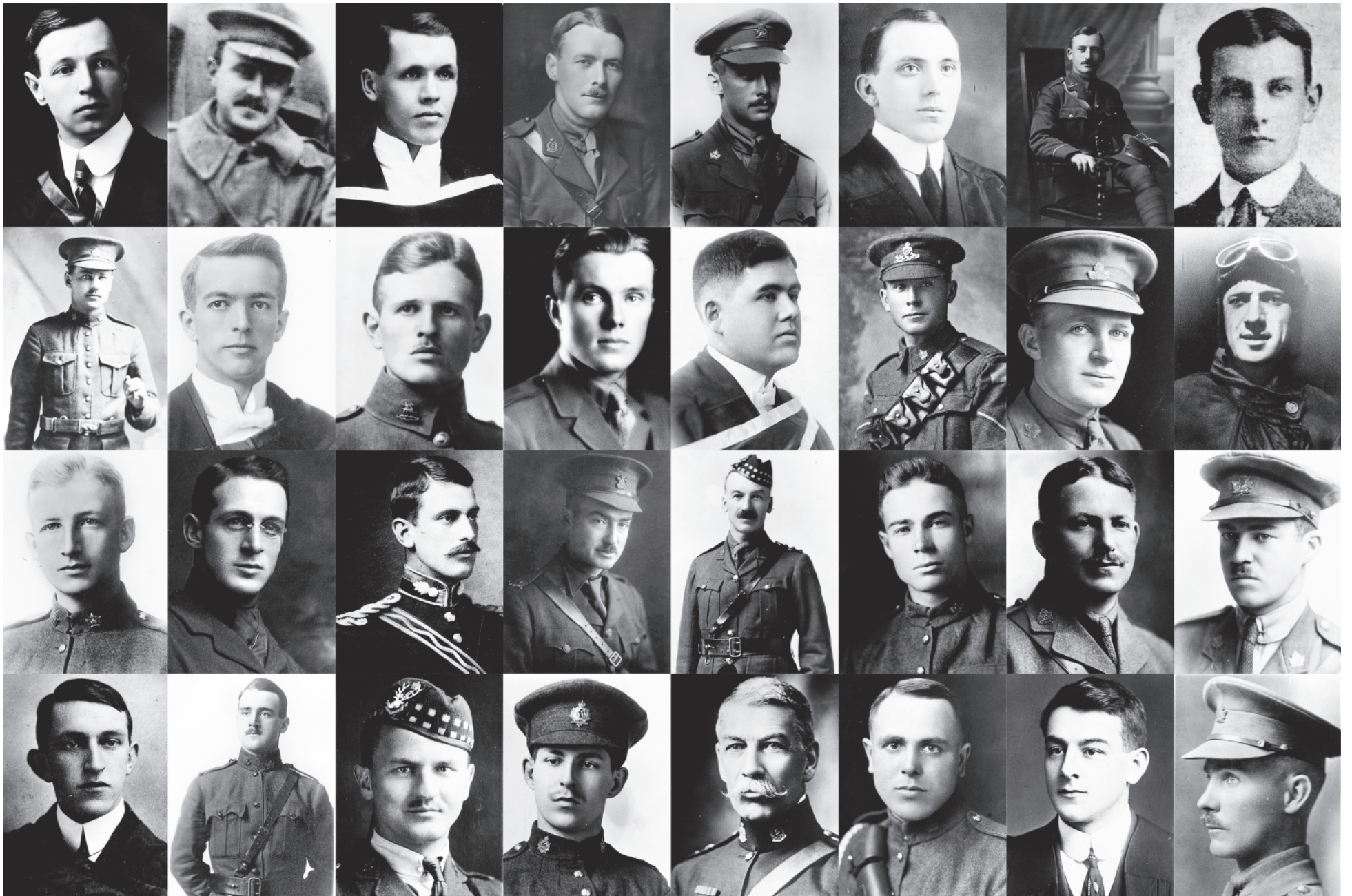
QUEEN'S UNIVERSITY ARCHIVES