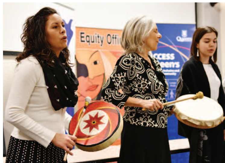
The Four Directions Women Singers performed an honour song for the award winners, and a travelling song to mark the end of the event.

Call for a complimentary evaluation 613.539.0000