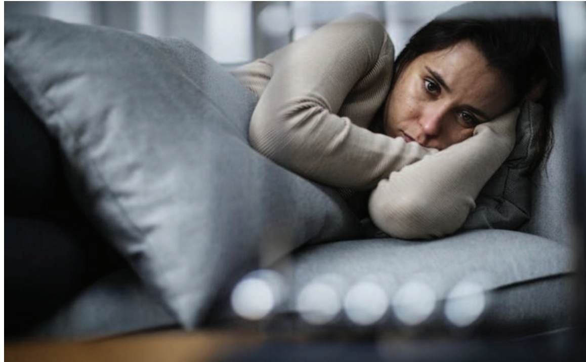
A new study reveals that depression is more commonly diagnosed when clinicians ask the person with autism directly about their symptoms, rather than asking a caregiver.

It also reveals that depression is more common in individuals with autism who have higher intelligence.