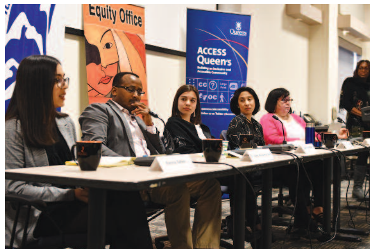
A panel explored matters of equity and inclusion within higher education, and took questions from the audience.