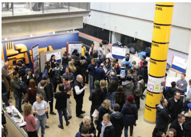
More than 4,000 prospective students, applicants and family members attended Queen's March Break Open House on March 10. This annual campus-wide event offers students the opportunity to tour campus and residence, try the food, attend a mini-lecture, meet faculty, staff and current students.

"In addition to an increasing number of applications, we are also seeing significant year-over-year increases in the percentage of students who are ranking Queen's as their first choice," says Stuart