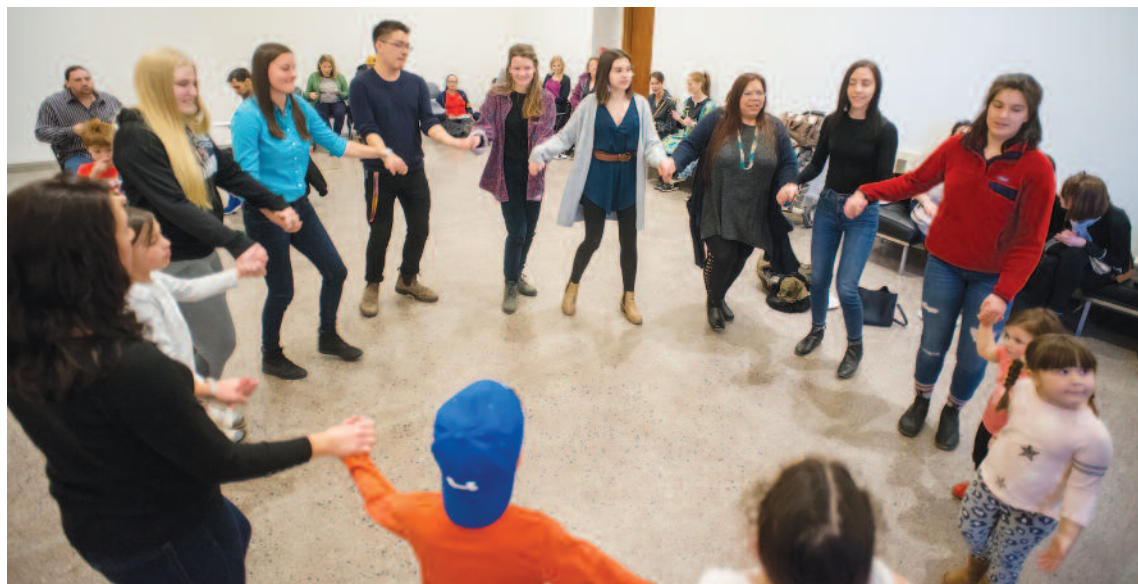
Members of the Queen's community take part in a Haudenosaunee round dance at the event marking the first anniversary of the release of the Queen's Truth and Reconciliation Commission Task Force's final report.

Some members of the Queen's community have also offered up their thoughts to the Gazette on