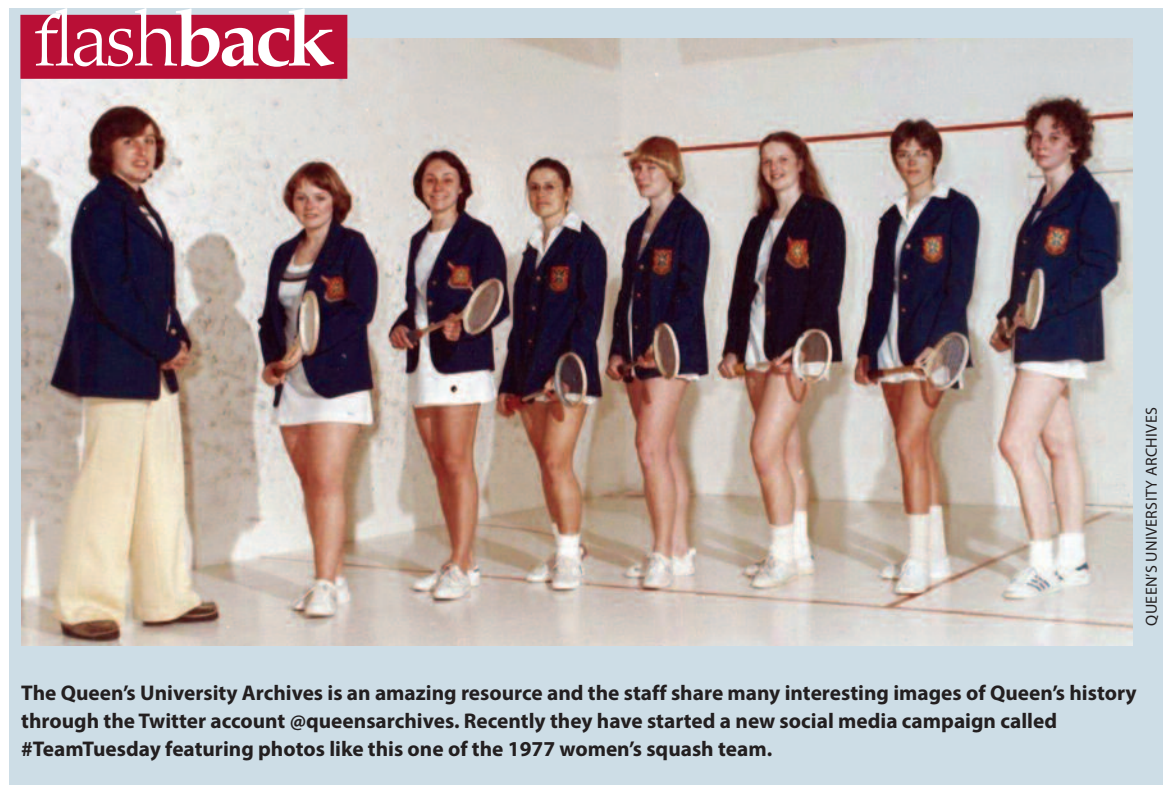
The Queen's University Archives is an amazing resource and the staff share many interesting images of Queen's history through the Twitter account @queensarchives. Recently they have started a new social media campaign called #TeamTuesday featuring photos like this one of the 1977 women's squash team.

energy of young people have played an enormous part in that. But passion made brittle by ideology that goes unexamined or unchallenged promotes hatred; it does not fight it. And so, faculty, students, staff and visiting speakers must continue to be allowed to articulate positions that will offend, challenge and even upset. It must be done safely and respectfully. Otherwise, in the long run, we are all the poorer and our fundamental shared values are at risk.