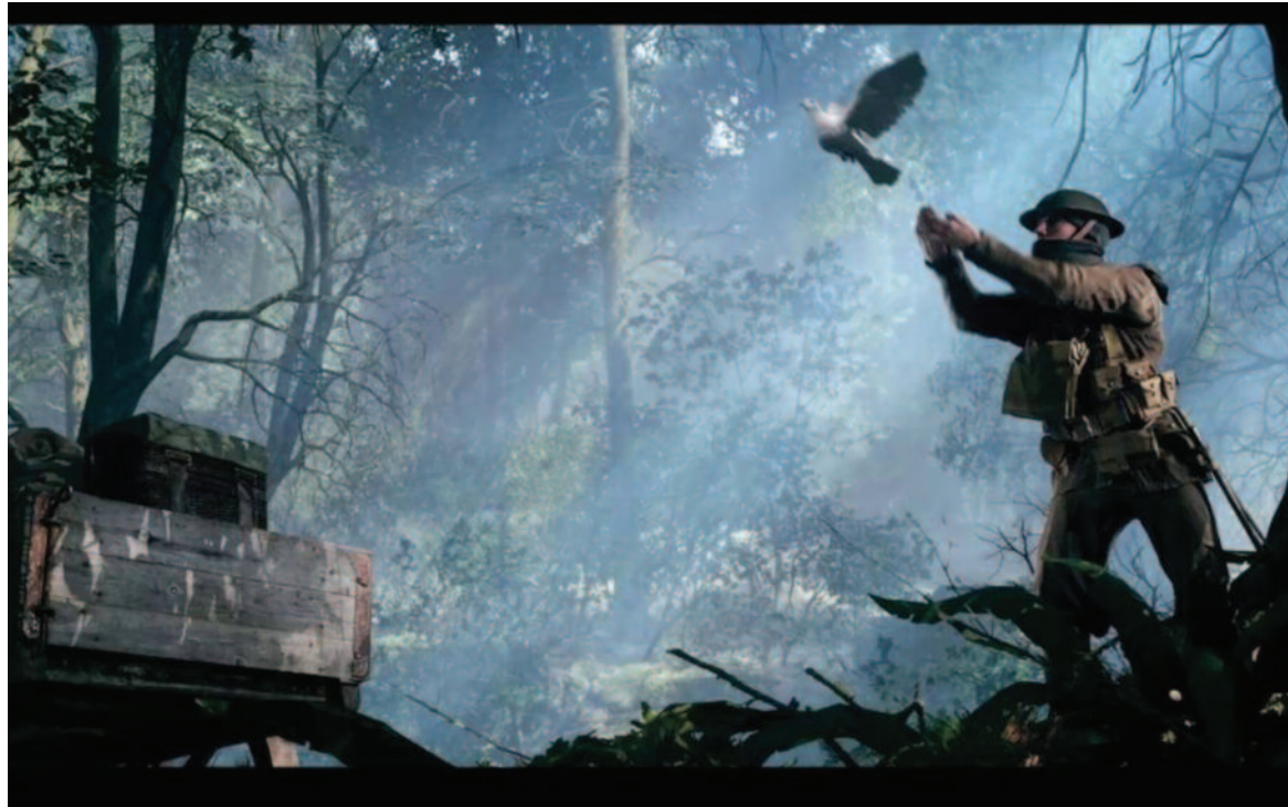
In the first-person shooter game Battlefield 1 , set during the First World War, player action and interaction shifts from driving a tank to releasing a messenger pigeon and navigating it to safety.

How can video games be confused for reality when its players view them as escapism and freedom from reality? In their book Rules of Play , scholars Katie Salen