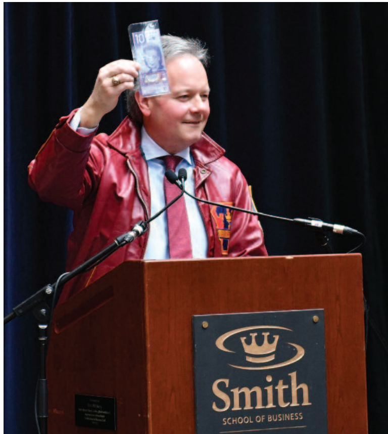
Stephen Poloz, Governor of the Bank of Canada, delivered the Chancellor David Dodge Lecture in Public Finance, entitled "Today's Labour Market and the Future of Work" at the BMO Atrium of Smith School of Business on Tuesday, March 13, and later held a media conference in Goodes Hall.