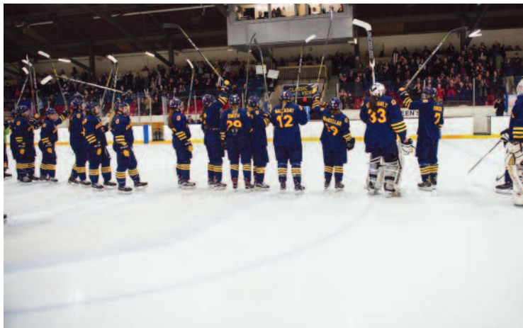
The Queen's Gaels women's hockey team salutes their fans at the Memorial Centre following the McCaw Cup final on Saturday, March 10. The Gaels fell 3-0 to the No. 7 Western Mustangs.

The Gaels had another early power play in the third period but came away with nothing to show for it. Just after the advantage ended, the Gaels appeared to have scored after a Mustangs