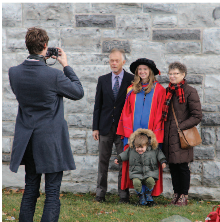
Not every photo works out the way they were planned as this boy is clearly not as excited as the rest of his family to pose for a snapshot outside Grant Hall following a Fall Convocation ceremony.