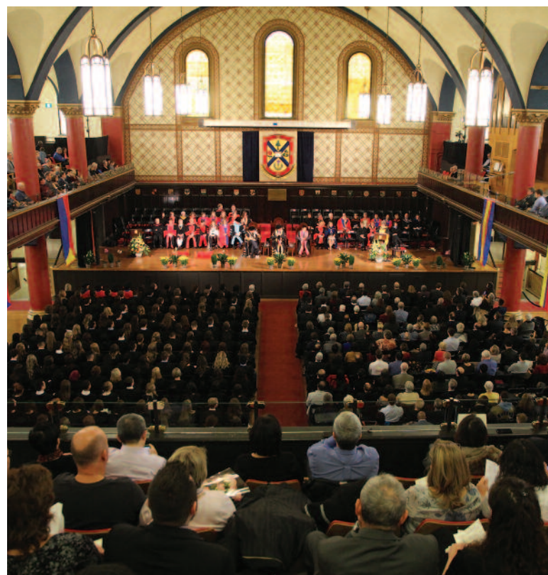
For some of the bigger ceremonies during Fall Convocation, Grant Hall's balcony fills up with family and friends eager to see their graduate cross the stage.

As always each ceremony was a special event for the graduates, their friends and family, as well as for faculty and staff.