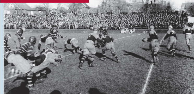
In this photo from 1923 the Queen's Gaels, then known as the Golden Gaels, face their rivals from McGill at George Richardson Memorial Stadium on Oct. 27. Also, seen in the background is the Douglas Library under construction. Queen's went on that season to win the 11th Grey Cup.