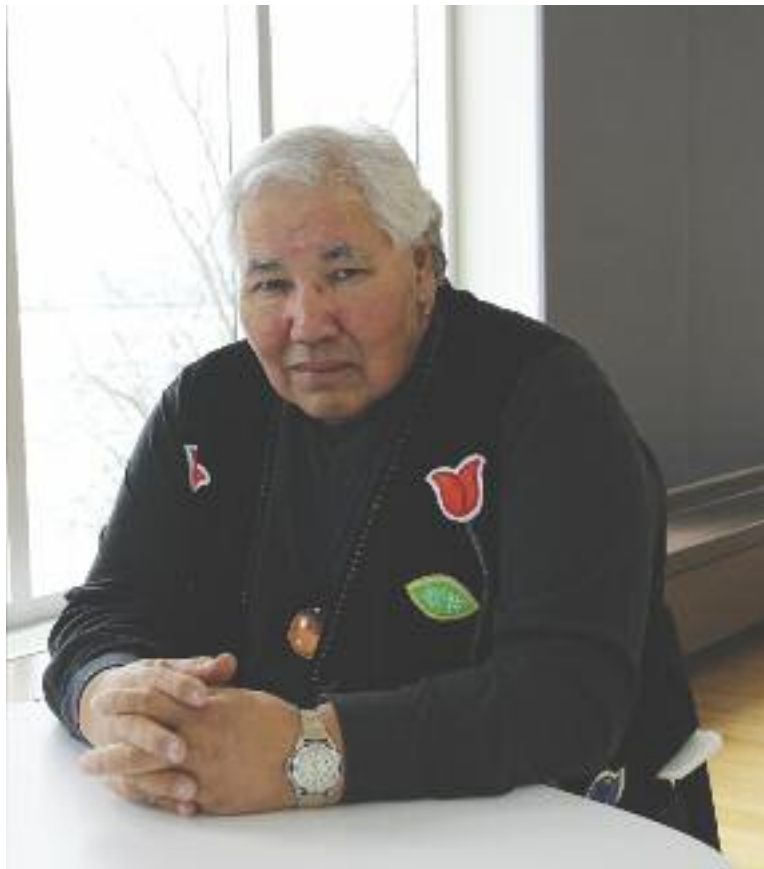
The Hon. Justice Murray Sinclair believes post-secondary institutions have an obligation to encourage academic discourse and research about Indigenous issues.

The number of Indigenous people who went through residential schools is not much more than 30 per cent of the total Indigenous population in Canada. Yet most Aboriginal people in